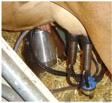
Picture shows modern day milking practices with the use of self operating milking machines.