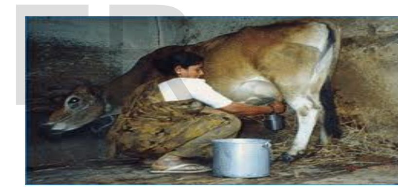
Traditional method of Hand milking the cow