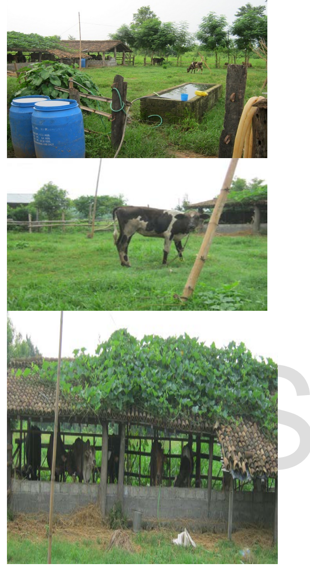
Picture taken in a local Dairy Farm that raises cattle following traditional practices with organic diet and free access to pasture with animals getting ample of exercise, in Nawalparasi, Nepal.