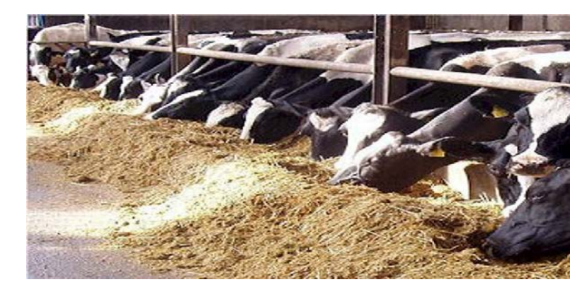
Picture taken from another dairy farm whereby the animals are being raised commercially and are being fed an artificially formulated diet with virtually no space to move.