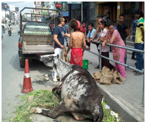
Left :Photo of an Abandoned Cow in the streets of Kathmandu Nepal,in a very miserable condition. Right :People come for rescue.